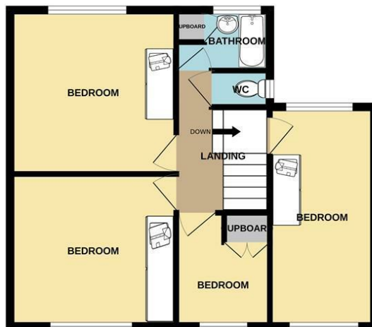
1ST FLOOR 505 sq.ft. (46.9 sq.m.) approx.